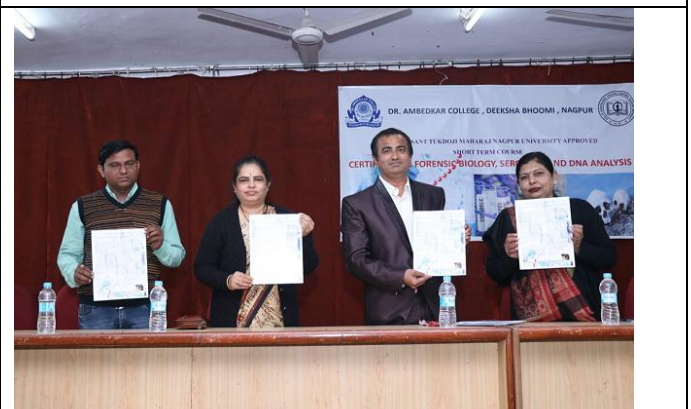
Unveiling of Boucher by dignitaries