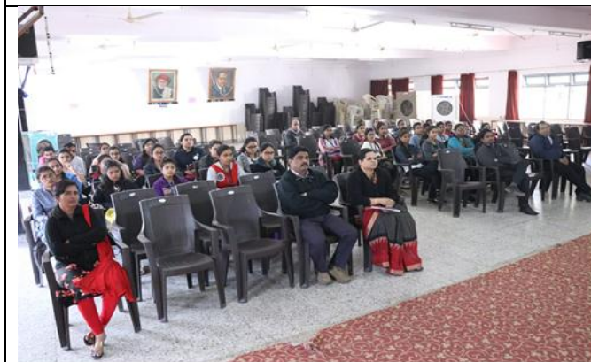
Participants and faculty Members in programme